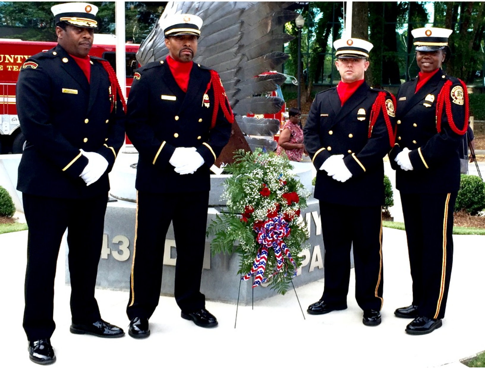
DeKalb Fire Honor Guard On Post at 9/11 Ceremony