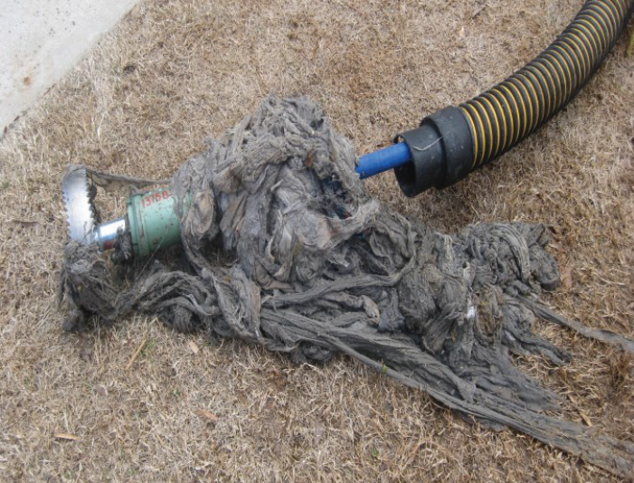
Gauze pulled from a manhole which caused a major spill in DeKalb County in 2015.